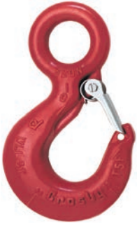
L-320N EYE HOOK